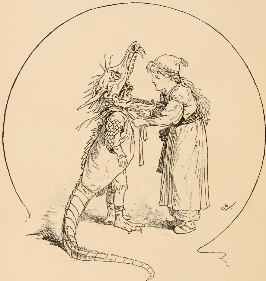
DRESSING THE DRAGON.